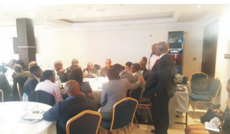
Cross Section of Participants at the NCR Workshop Organised by Bankers Sub-Committee on Economic Development in Lagos held on the 17th of November, 2016.